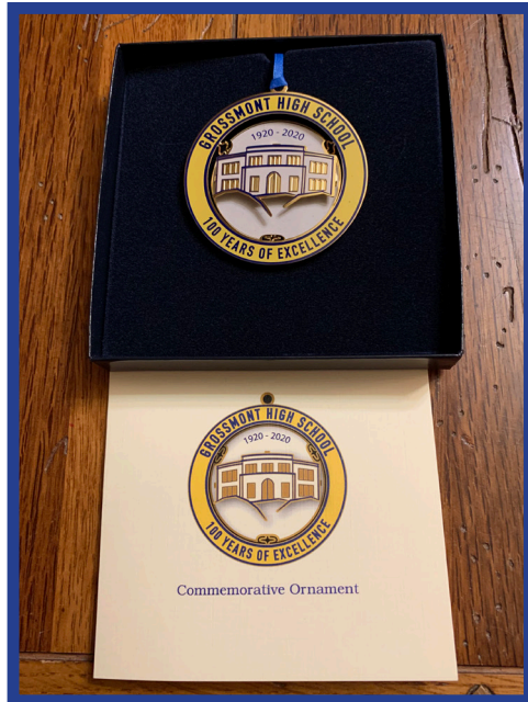
100th Anniversary Ornament